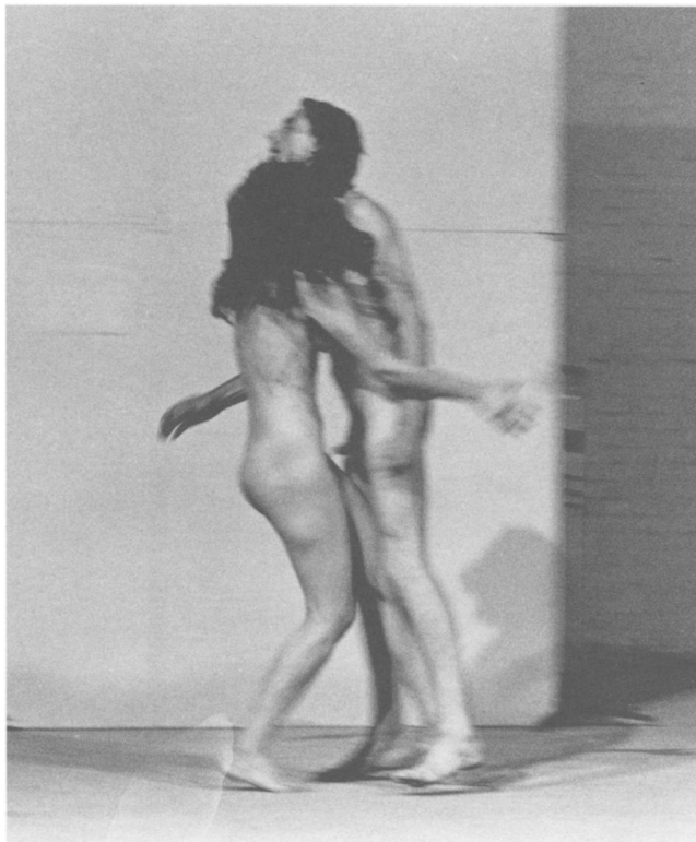
FIG. 1 Marina Abramovic/Ulay, Relation in Space . Performed at Venice Biennale, 1976.

I have been accused on the one hand (by art historians) of not caring enough about “the archive” and artistic