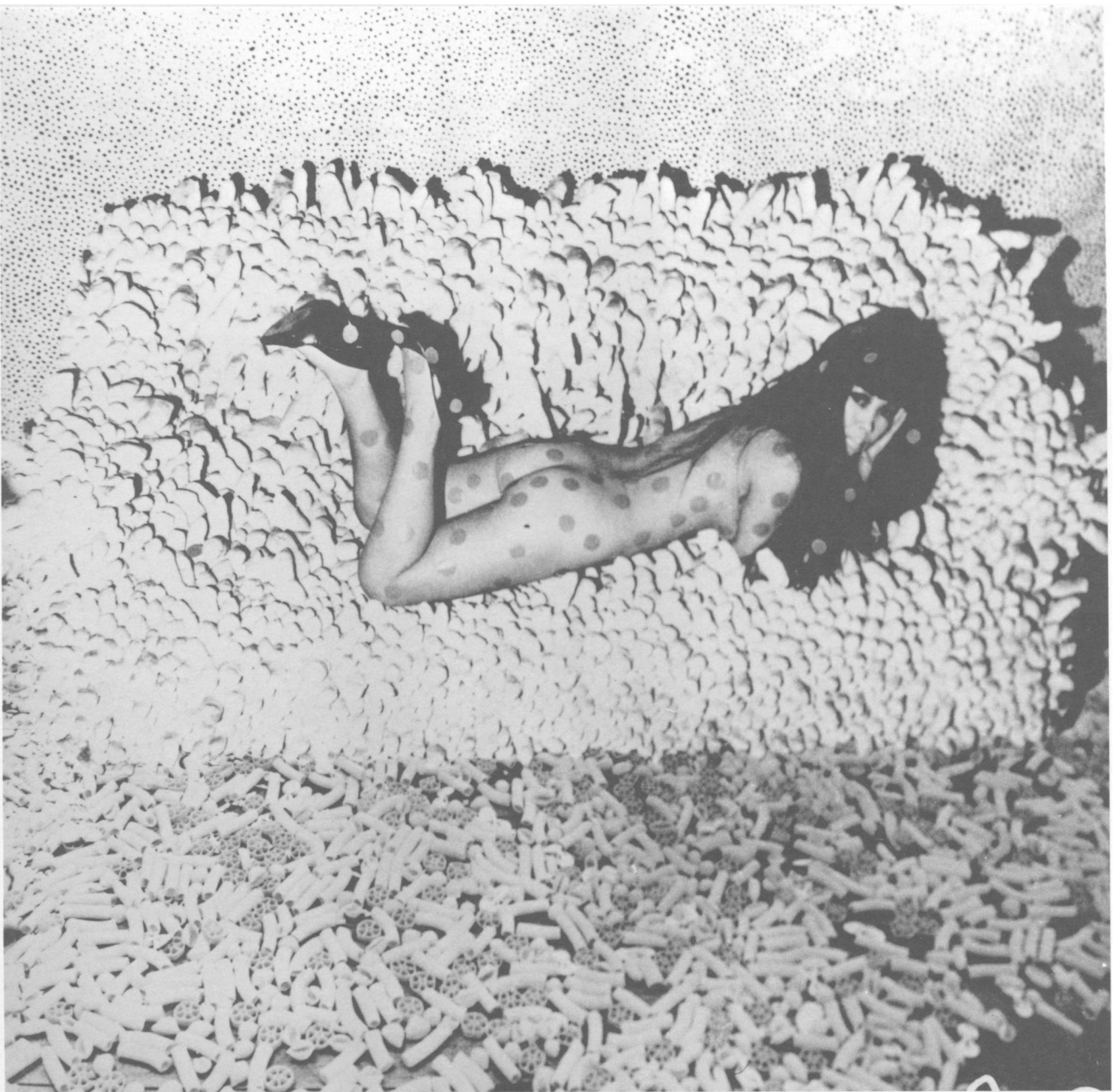
FIG. 3 Yayoi Kusama, Self-Portrait , 1962.

polka-dotted wall (her installation Mirror Room and Self-Obliteration). Now, her pose and garb remove her from us, camouflage shifting her into the realm of potential invisibility (“self-obliteration”). She still can’t decide whether she wants to proclaim herself as celebrity or pin-up (object of our desires) or artist (master of intentionality). Either way, her “performance” takes place as representation (pace Warhol, she’s on to the role of documentation in securing the position of the artist as beloved object of the art world’s desires); she comprehends the “rhetoric of the pose” and its specific resonance for women and people of color. The pictures of Kusama are deeply embedded in the discursive structure of ideas informing her work that is her “author-function.” 20